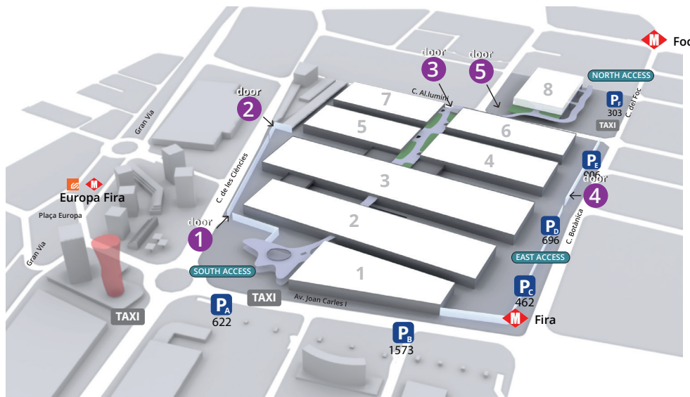
Lorry access to halls 1/7 is through door number 1, 3 or 4 Lorry access to halls 8.0 and 8.1 is through door number 5

Fira Barcelona Gran Via Venue is equipped with several access/exit doors as shown below. Please note that not all doors are accessible at all time, and therefore the venue team will inform you about which door has been allocated for your event.